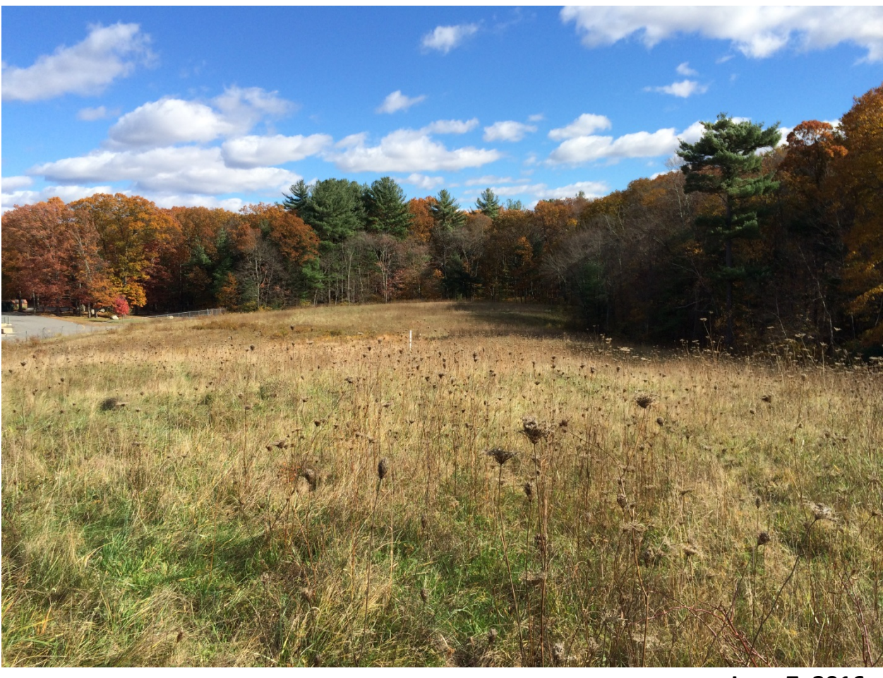
June 7, 2016