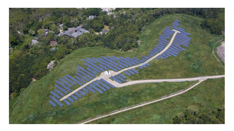
Town of Ludlow – 2.7mW, Borrego Solar, 17 acres

There are at least 30 solar installations on closed landfill in Massachusetts and the number is growing. The following is a representative list of sites.