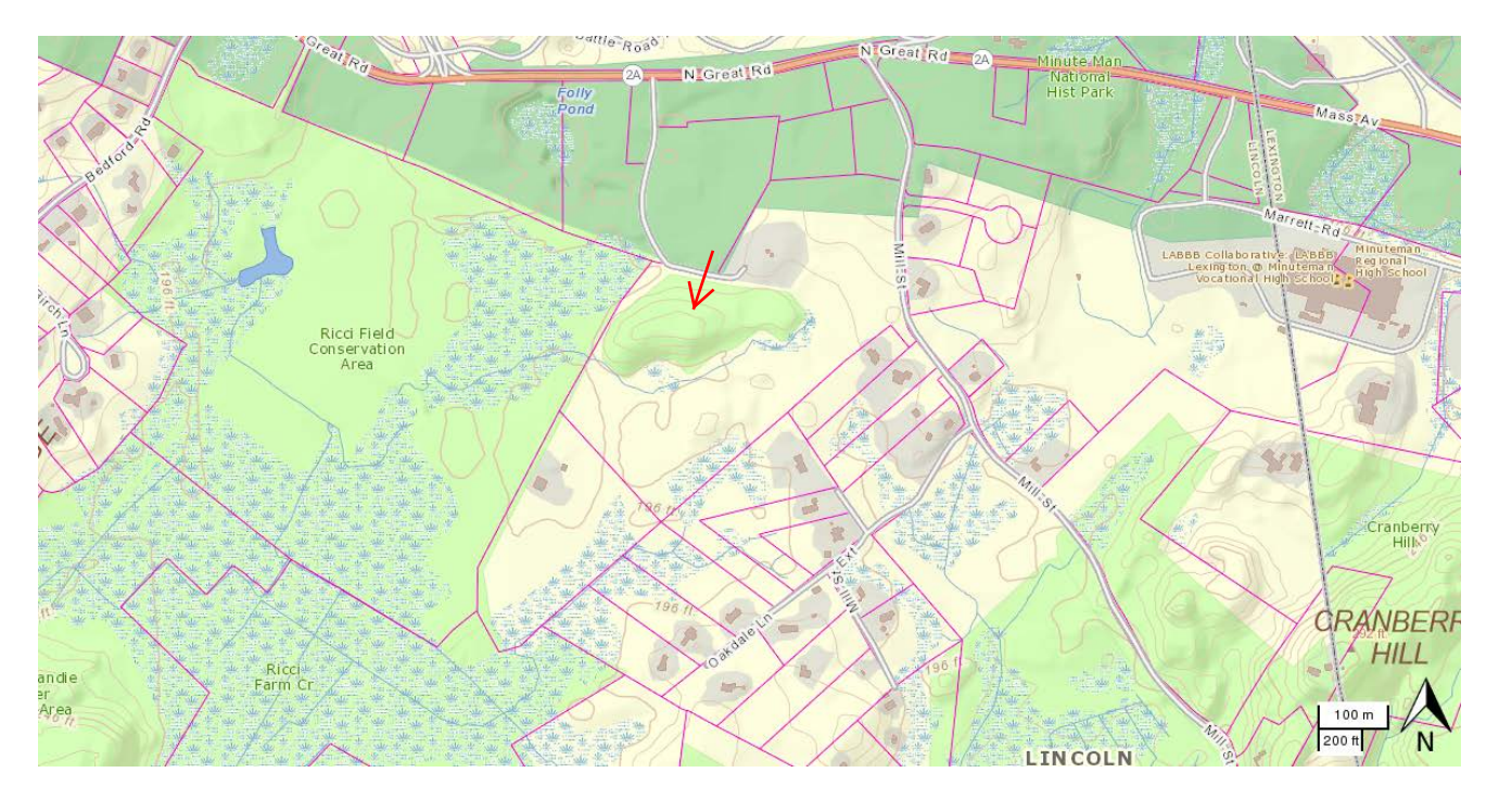
Figure 1: Site Locus (MassGIS)

The project site is a 7.1 acre parcel located on the west side of Mill Street that contains the capped landfill as shown in Figure 1 below. It is contained within a larger 36.61 acre Town-owned parcel incorporating the Transfer Station and surrounding woodland areas. The larger parcel borders the Ricci Field Conservation Area to the west, Minuteman National Historical Park to the north, Minuteman Technical High School to the east and residential land to the south. Virtually the entire conservation parcel within the larger Town-owned parcel consists of the capped landfill which is maintained as open field.