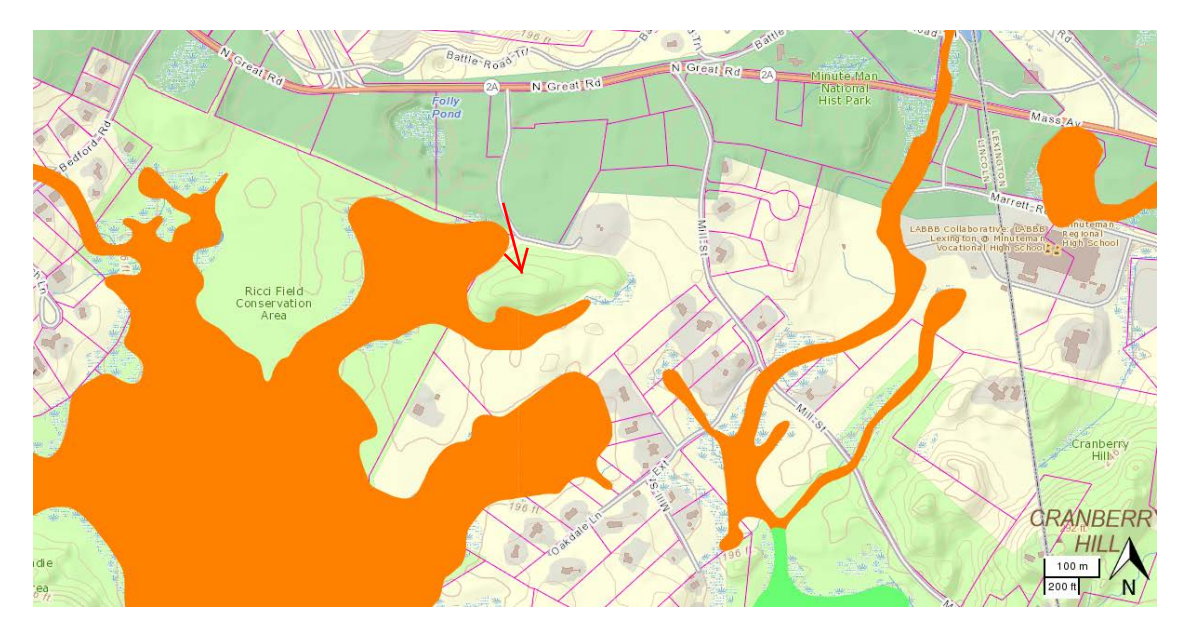
Figure 4: FEMA 500-year Flood Boundary, MassGIS

The west and south perimeter of the landfill are subject to a 0.2% annual chance of flooding, or 500 year floodplain as indicated by FEMA and depicted in Figure 4 below. The main portion of the site is not within mapped floodplain.