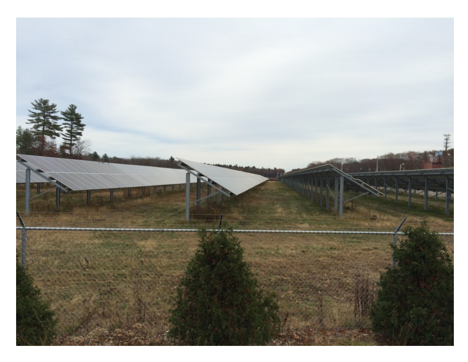
Photo 15: True North Energy, Salisbury, MA largest solar park in New England at time of construction in 2012. Installation is 5.7 mW and includes 50 acres