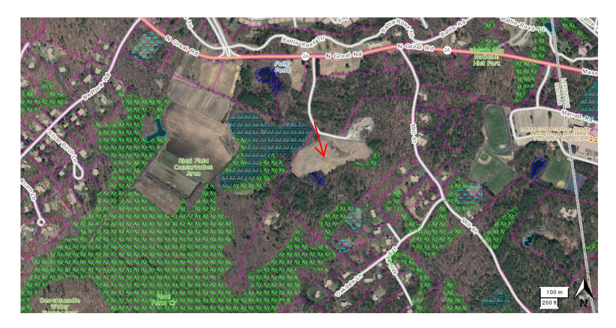
Figure 3: Wetlands Mapping, MassGIS